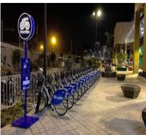
Fig.No 1: Public Bicycle Sharing System Dockless

Most of the Asian cities are facing several socio-economic problems related to transport such as traffic congestion, airpollution, GH Gemissions, traffic accidents and fatalities, noisepollution among others. It is estimated that road congestion alone cost Asian countries 2-5% of their GDP annually due to countless hours of delay, loss of economic opportunities and the waste of billions of gallons of fuel and higher transport cost.